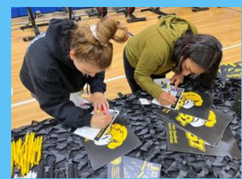
Active Duty Air Force, Reservists, and Mountain Home high school students attended this education fair.